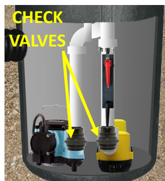
FIGURE A: SINGLE DISCHARGE